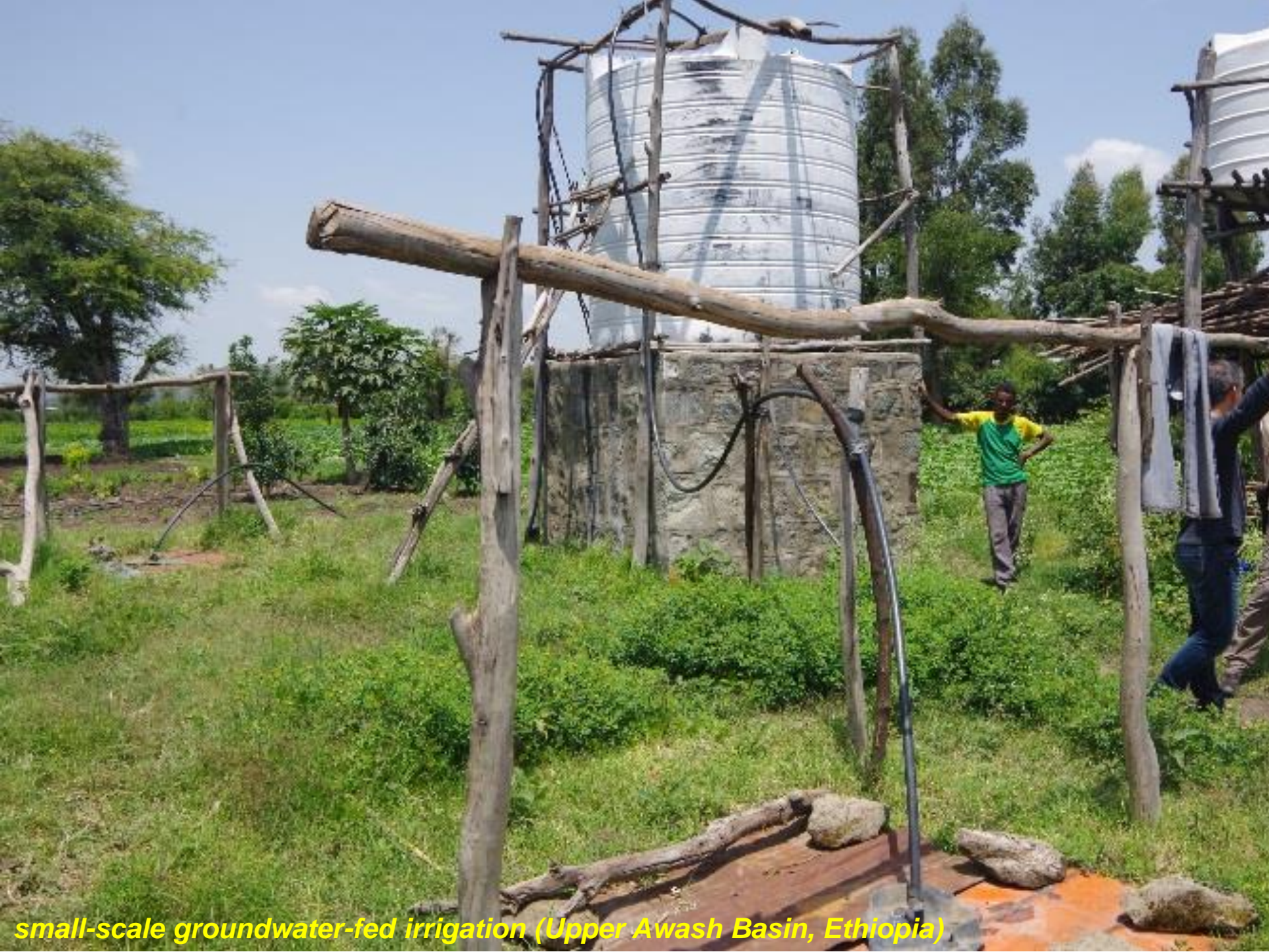
small-scale groundwater-fed irrigation (Upper Awash Basin, Ethiopia)