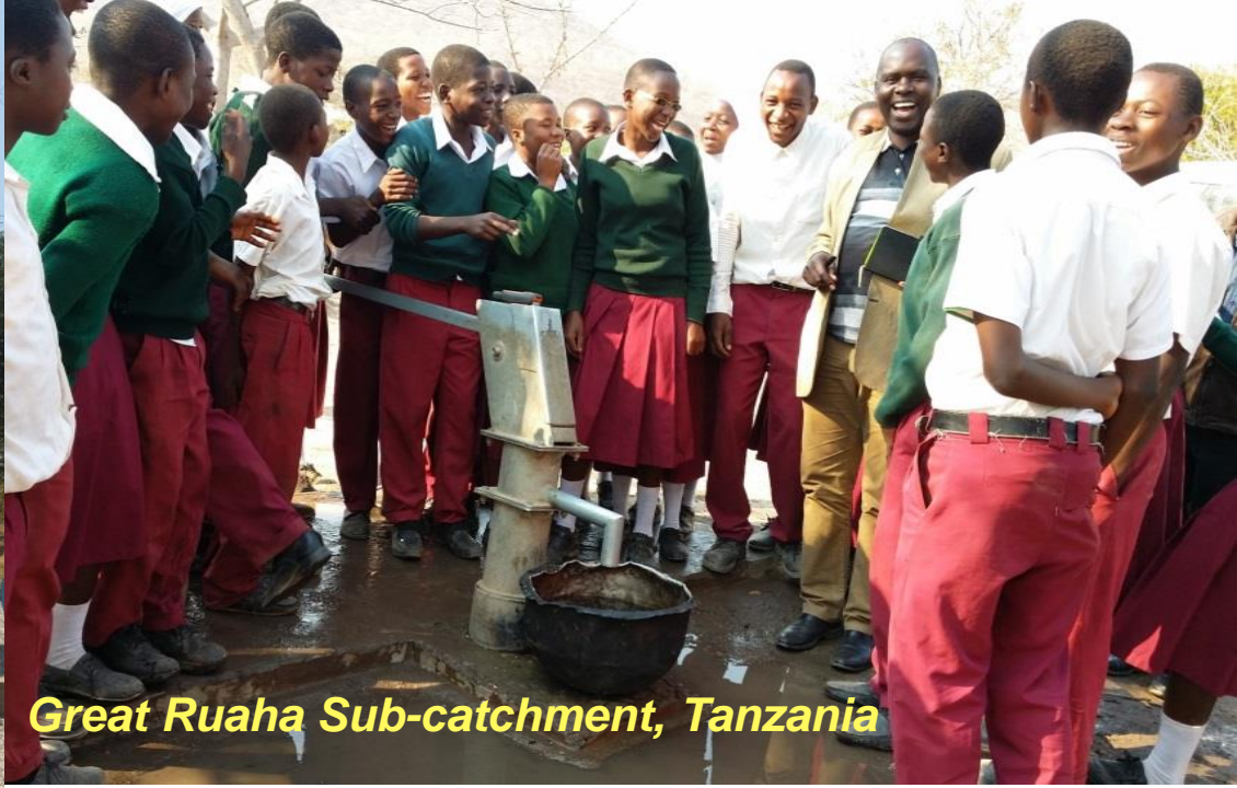
Great Ruaha Sub-catchment, Tanzania