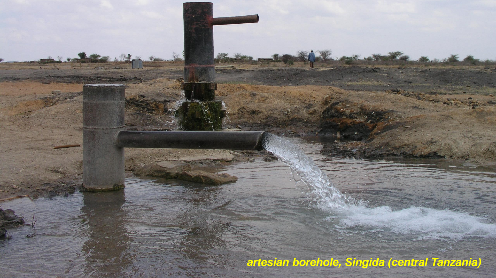
artesian borehole, Singida (central Tanzania)