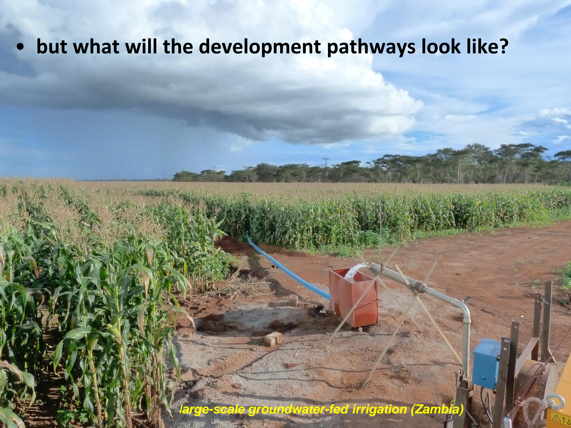
large-scale groundwater-fed irrigation (Zambia)